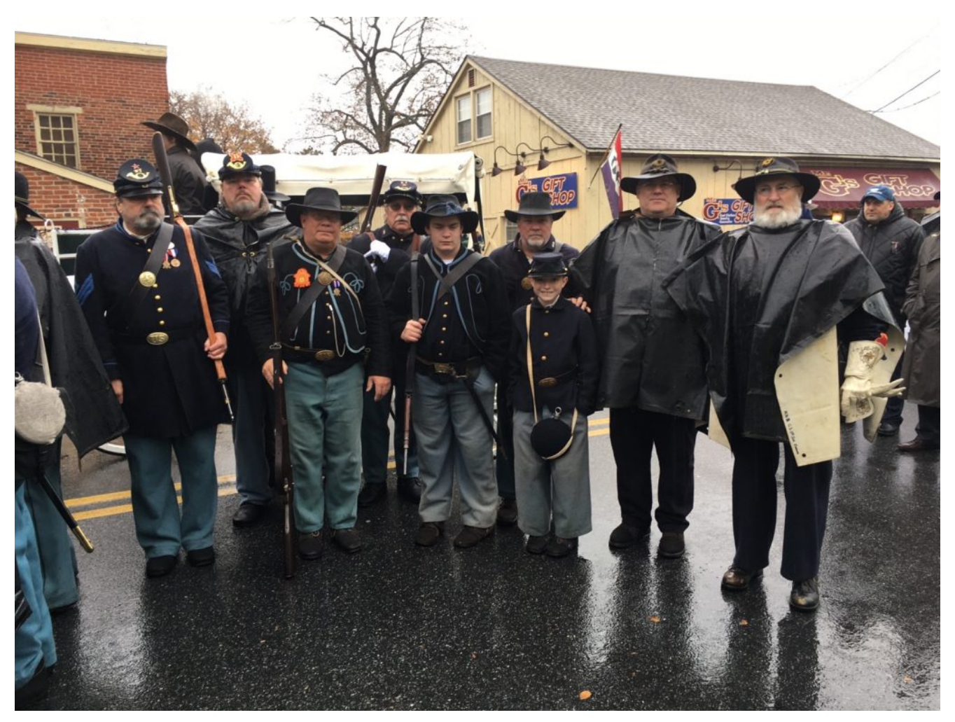
Co. D, 27th Indiana Volunteer Infantry, Sons of Veterans Reserve.