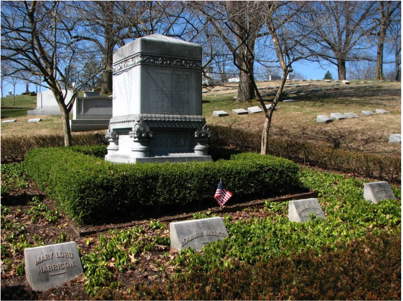
Grave of President Benjamin Harrison as it appears today.

An outpouring of tributes to Harrison was published in newspapers across the nation. As president, he was remembered for his conscientious devotion to duty with absolute integrity and service in the best interests of the country. He was lauded as a great statesman, lawyer, and orator. During his presidential years, perhaps due to shyness, he was at times criticized for being aloof, cold, and unsympathetic under the stress of public duty. But those who knew him personally, saw him in an opposite light: unpretentious, genial, generous, and tender hearted. Years later, the American intellectual Henry Adams spoke of Harrison as the best President since Lincoln.