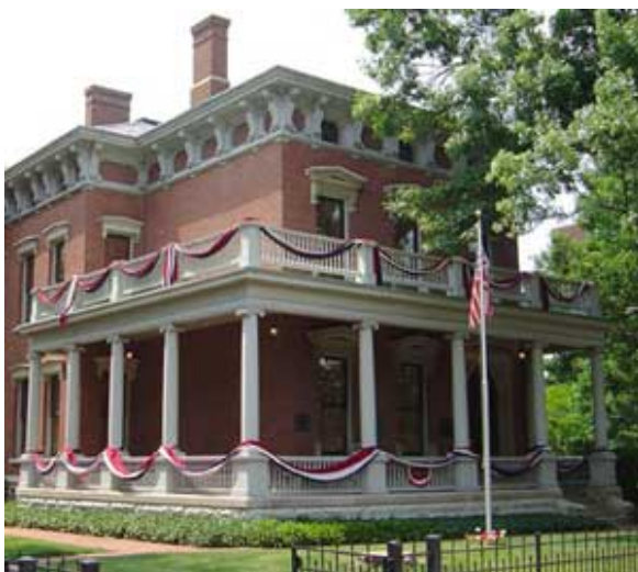
Benjamin Harrison Home — Indianapolis, IN

Two weeks after his wife's death, Benjamin Harrison lost reelection to Grover Cleveland. The rigors of the office most certainly began to wear down the president. After being defeated by Grover Cleveland in his reelection bid, President Harrison, it is said, told his family that he felt as if he had been freed from prison. With his presidency behind him, he looked toward the future with renewed optimism.