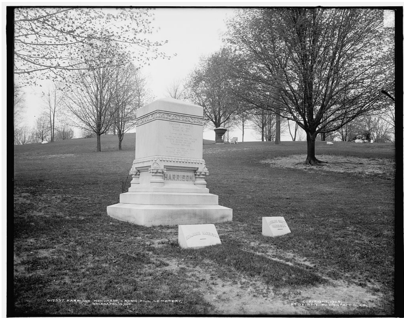
Grave of President Benjamin Harrison as it appeared in 1904.