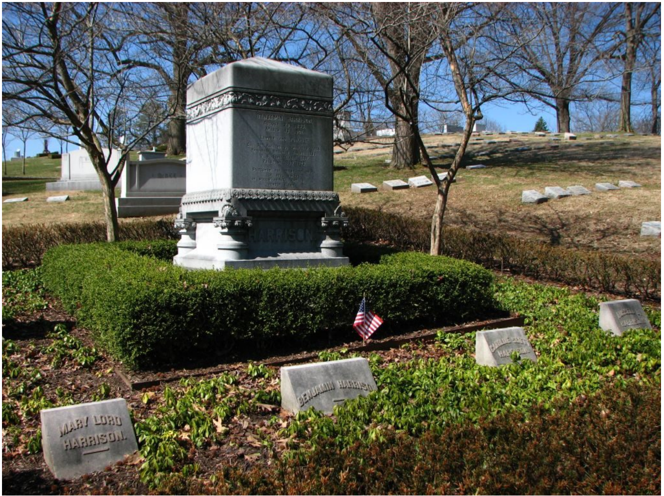
Grave of President Benjamin Harrison as it appears today.

An outpouring of tributes to Harrison was published in newspapers across the nation. As president, he was remembered for his conscientious devotion to duty with absolute integrity and service in the best interests of the country. He was lauded as a great statesman, lawyer, and orator. During his presidential years, perhaps due to shyness, he was at times criticized for being aloof, cold, and unsympathetic under the stress of public duty. But those who knew him personally, saw him in an opposite light: unpretentious, genial, generous, and tender hearted. Years later, the American intellectual Henry Adams spoke of Harrison as the best President since Lincoln.