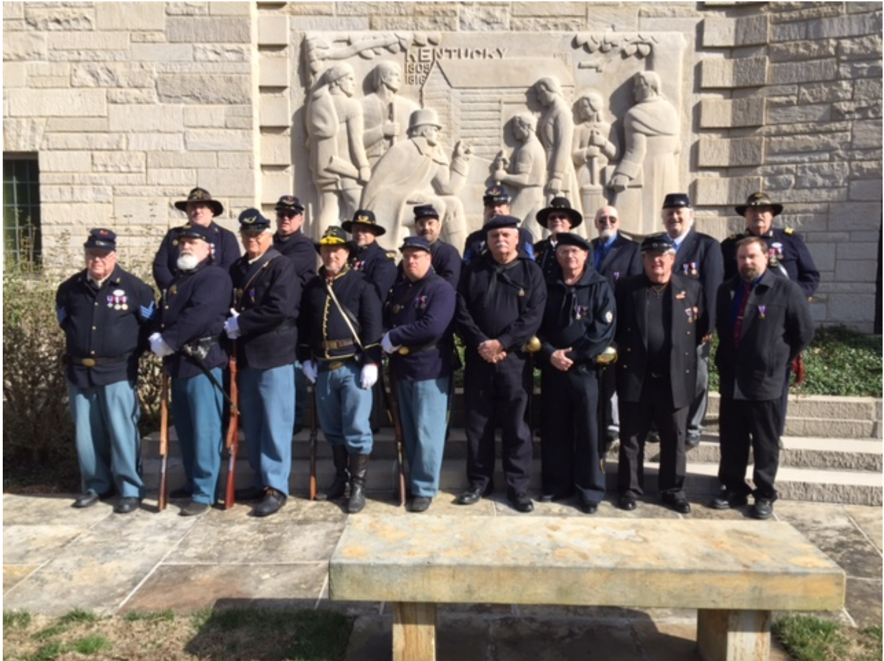
2016 Lincoln Day, Lincoln Boyhood Home National Monument, Lincoln City, Indiana, February 7, 2016.