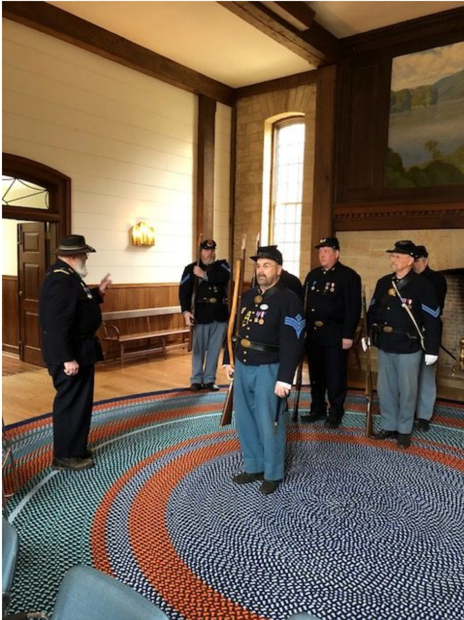
Members of the 27th Ind. SVR going through instruction on the manual of arms.