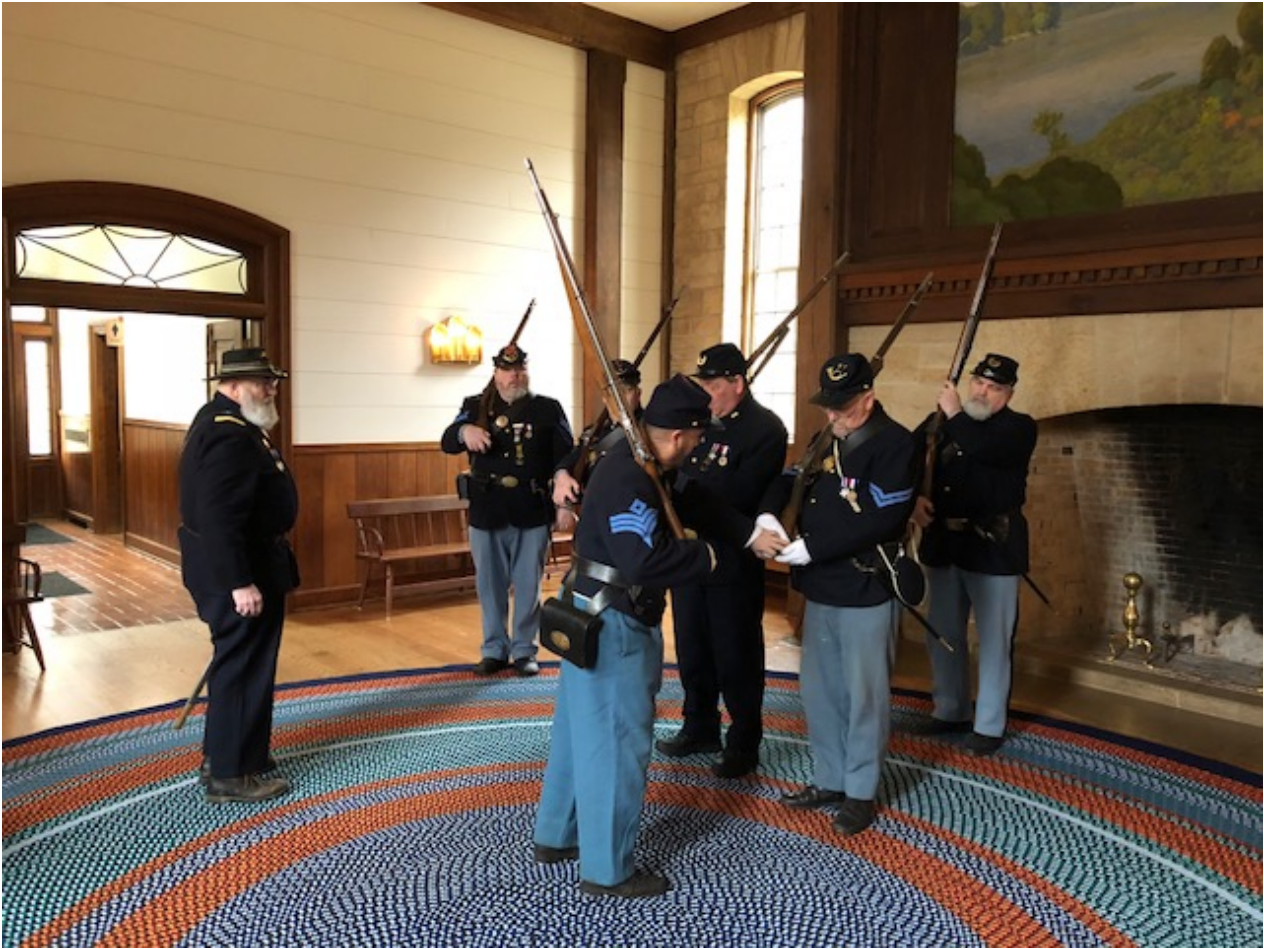
Members of the 27th Ind. SVR going through instruction on the manual of arms.

Click on any document image to view full size and/or print.