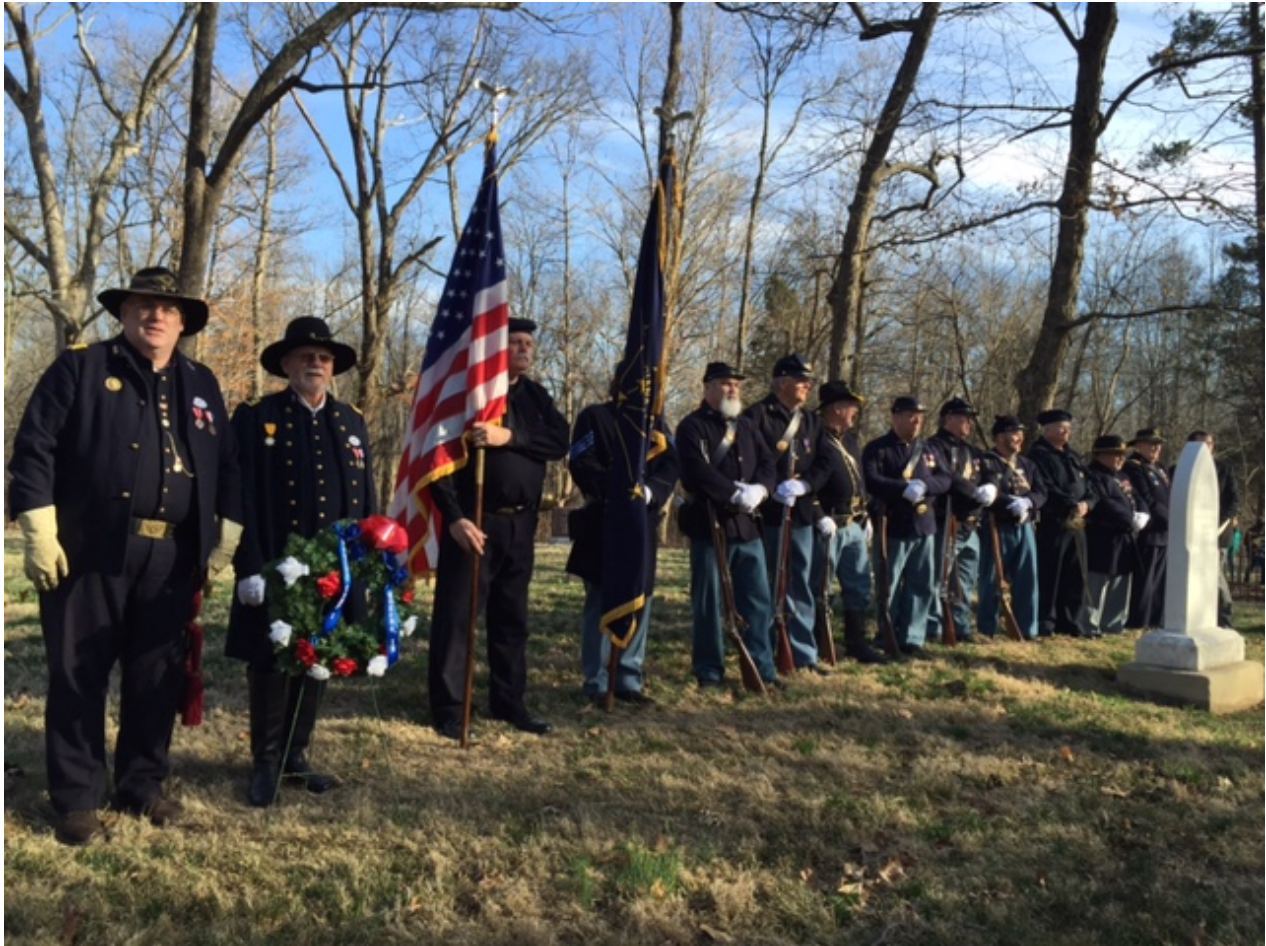
Co. D, 27th Indiana Volunteer Infantry, Sons of Veterans Reserve at the grave of Nancy Hanks Lincoln.