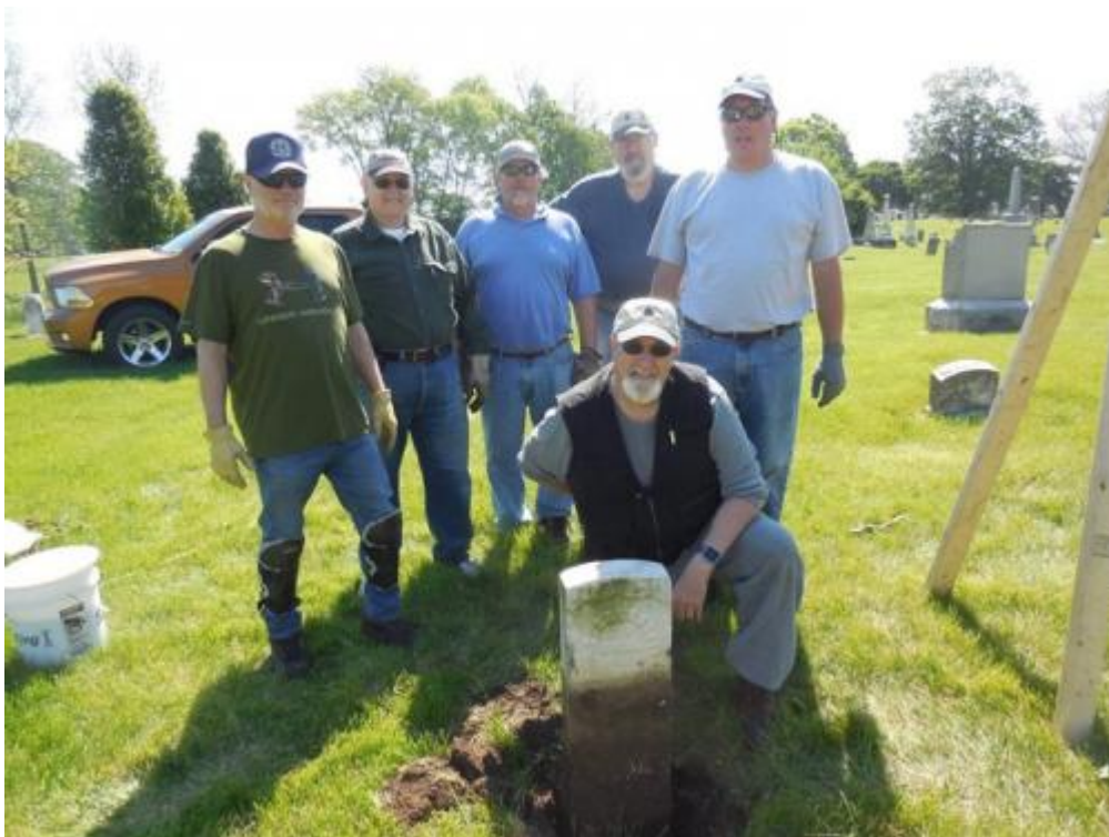
City Cemetery, Shelbyville, Indiana, May 14, 2016