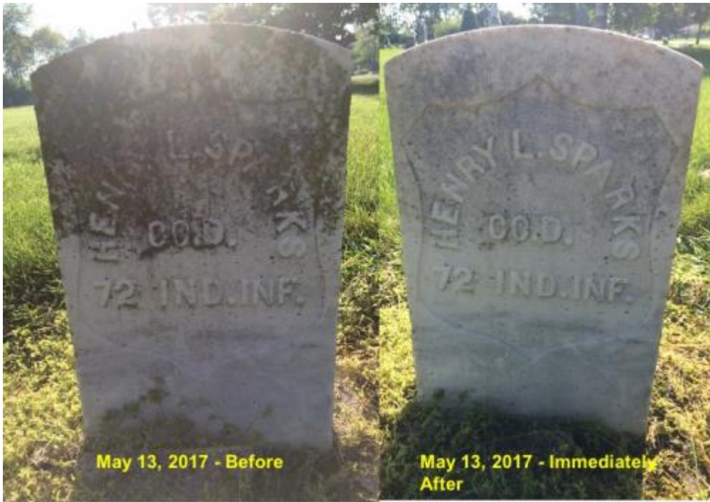
May 13, 2017 - Before