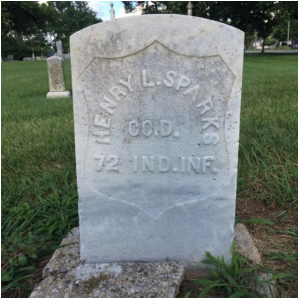
May 13, 2017 - Immediately After